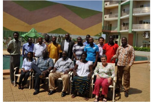
Figure 2 – Inception workshop of the PAEPARD consortia, October 2014, Ouagadougou, Burkina Faso.

The consortia drew up their concept note and a work plan aimed at refining their research proposals in order to improve their responses to future funding applications. They developed their research activities within their individual structures, with the support of members' expertise (Energy-Compost- 2015), established economic partnerships between consortia members (Energy-Compost/Cosmetics-2015), and with the support of the Research Coordinator for the European partners which could provide technical expertise, but also eventually a commercial outlet (European Biofach/Vivanness trade fair, 2015 and 2016, Cosmetics and Energy-Compost consortia, Figures 3-4).