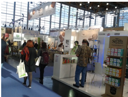
Figures 3-4 – European Biofach/Vivanness trade fair, February 2016, Nuremberg, Germany.

The consortia now have an intranet platform set up by PAEPARD during the 3rd quarter of 2015, thus enhancing internal communication between members but also with the ULP Coordinator. Eventually, each of these electronic platforms should present a higher profile to future partners who might be interested in the projects developed by the consortia.