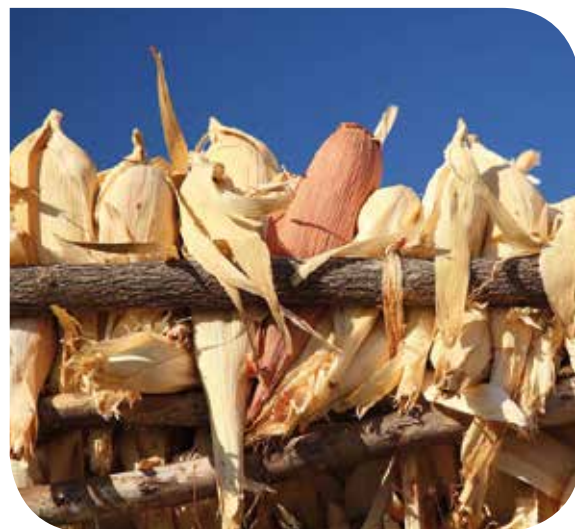
Mozambique Drying maize traditional.

PAEPARD streamlined and synthesized its approach and has built up its credibility through greater awareness and knowledge about the research and non-research problems associated with aflatoxin contamination. This was not without its controversies. It however exemplifies very well the various individual strategies and the necessary concertation for a common level of information and joint actions.