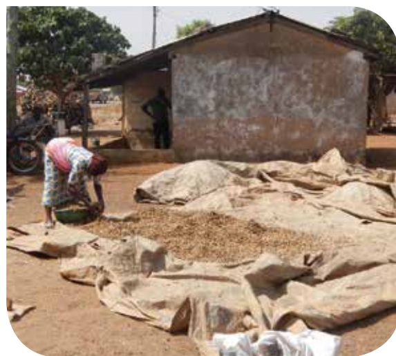
Drying groundnuts on tarps in Ghana.

Biological control using microbial antagonist strategy has emerged as a promising approach for control of pre-harvest contamination of aflatoxins. The antagonist microorganisms include competitive atoxigenic strains of yeasts or bacteria, and symbiotic fungi ( Trichoderma spp., Beauveria spp., mycorrhiza). In Africa, some microorganisms almost exclusively atoxigenic strains of Aspergillus spp. are already available as branded products. However, several challenges ranging from economic to environmental sustainability have not yet been addressed 2 .