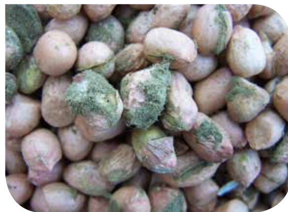
Mozambique Contaminated groundnut kernels.

Aflatoxins are very powerful, broad acting natural toxins produced as secondary metabolites by selected fungi (particularly Aspergillus parasiticus and A. niger ) growing in dried, or drying foods and feeds such as grains and seeds, fruits and tubers. Since 2009 surveys on the aflatoxin contamination of maize have been carried out in different parts of Kenya. The results that have shown alarming levels of aflatoxin contamination of maize have been discussed with farmers and other stakeholders including the Kenya National Federation of Agricultural Producers, and all agreed that addressing the aflatoxin contamination of maize is a priority. Farmers and other stakeholders have also incurred big economic losses; for example in 2010 when 2.3 million 90-kg bags were declared unfit for food or feed due to aflatoxin contamination. Heavy mortalities have been caused through the outbreak of aflatoxicosis periodically. During the worst outbreak of aflatoxicosis in Kenya in 2004 2 , 317 cases of poisoning were reported and 125 people died.