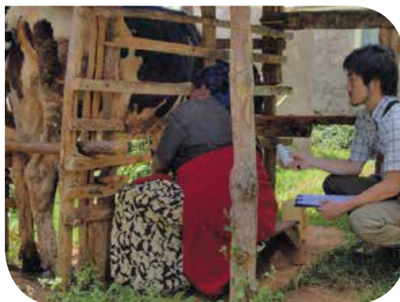
Kenya Sampling milk.